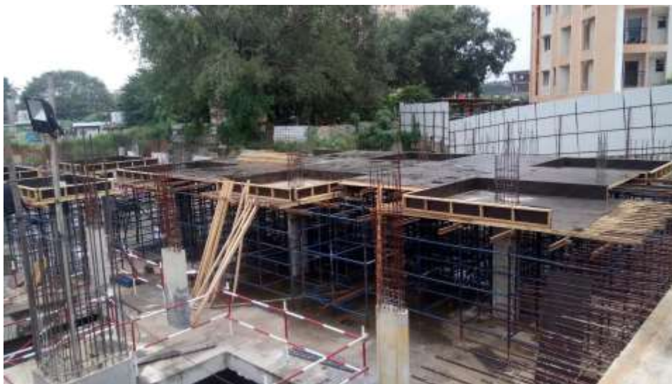
V. Basement 2 to 1 Ramp Staging Work