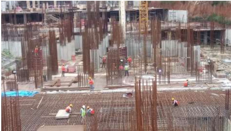
IV. Basement 1 Podium Shuttering Work