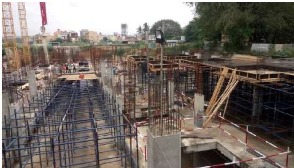
VI. Basement 2 Shuttering Work